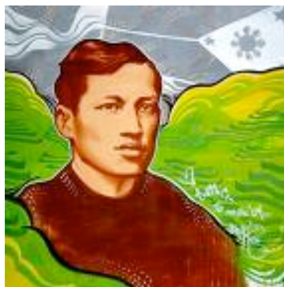
Filipino revolutionary, Jose Rizal worked to better the social standing of his people by inspiring them to be as good as the Spaniards who were persecuting them.

Education brought the Philippines out of poverty before and many Filipinos still think that it can do the same today. This is the reason why Filipinos see education as a valuable thing. Many children have to trek through jungles for miles just to get to the nearest classroom. This sounds like a gross exaggeration, but sadly it is true in many parts of the Philippines. In the Philippines, many children cannot go to school for one of two main reasons. Either the parents cannot pay for the education of their children while also paying for daily living, or there is no school where the family lives. The latter is commonly true of families living in the rural areas of the Philippines. In this respect, the lack of education in rural areas is a divisive factor in the Philippines. This is why the government is striving to establish more schools and send more teachers to those areas.