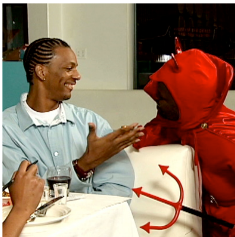
The quality programming on BET that I'm not allowed to watch.

later on that I realized the implications of what she said. According to her, because of what little she had seen from me in about 3 weeks, this girl concluded that I am sort of outsider, who is out of touch with black culture. According to her, one must wear baggy clothes and speak with poor English in order to be considered black. But when is my race and creed defined by such superficial things. No amount of slang can effectively change who I am and who my ancestors were, quite frankly, to think otherwise would be purely ignorance.