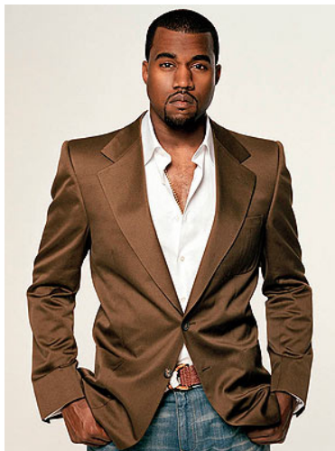
Rapper, Kanye West

When most people think about rap music, the image that comes to mind is a music video with a rapper with way too much jewelry, clothes that don't fit, and scantily dressed women dancing in the background. Sometimes they throw in a couple of Escalades or old school Chevys with 30 inch rims, too. But that's not