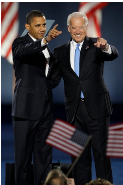
President-elect Barack Obama standing with his running mate, Joe Biden, at Grant Park

Many people who aren't African American have this strange curiosity about Black hair. Now, there is nothing wrong with curiosity, but there is a point