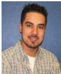
By Gustavo Ulloa Class of '09

Undoubtedly at IMSA, it's quite impossible to walk around for a day and not notice the great diversity that exists amongst us. Whether it's peeking your head into a classroom or just having lunch in the cafeteria, one can see how diversity essentially formulates a picture of IMSA where learning along side colleagues from different cultural backgrounds becomes a reality. This notion, however, can be misinterpreted by many, especially when cultural factors such as language are forgotten.