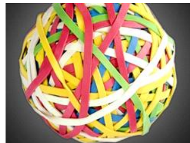
Screen clipping taken: 9/13/2010, 3:52 PM

Are you ready to stretch your imagination? The Akron Global Polymer Academy of The University of Akron is hosting the third annual Rubber Band Contest for Young Inventors to encourage students in grades 5-8 to demonstrate their creativity and ingenuity by creating an invention that incorporates the use of rubber bands. Link: http://rubberbandcontest.org/