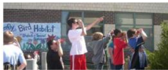
Screen clipping taken: 9/2/2010, 12:01 PM

http://www.fledgingbirders.org/challenge.html